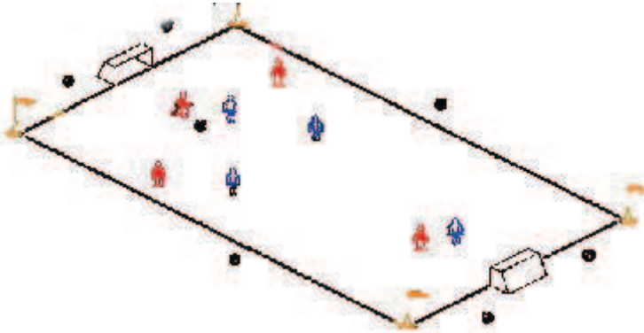
4 v. 4 The Basic Game